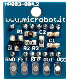
Tab.1 – Connections